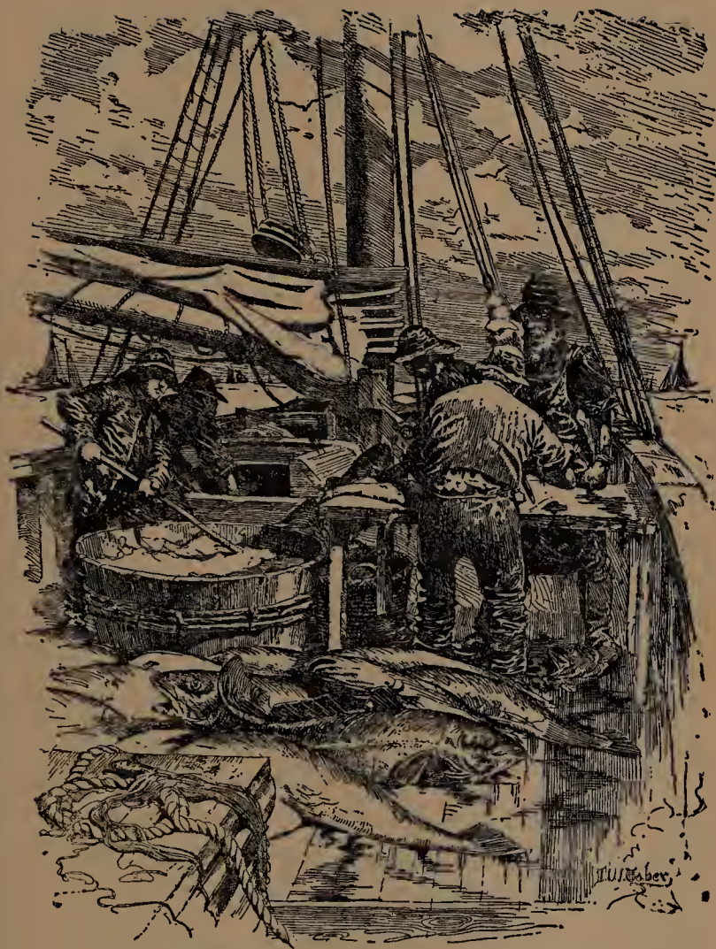
DRESSING DOWN ON THE "WE'RE HERE."